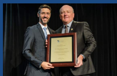
Long-serving UQTR Professor Receives Top Award for Service