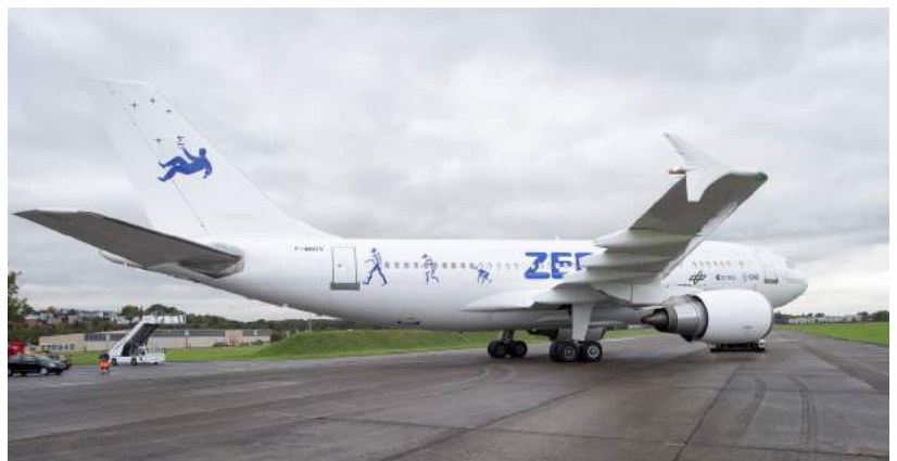
Modified Airbus A310 used for the parabola flights

"Our findings suggest the inclusion of real-time muscle activity measurements concurrent to our spinal stiffness measurements during a standardized postural protocol."