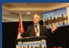
WFC ACC Education Conference Report