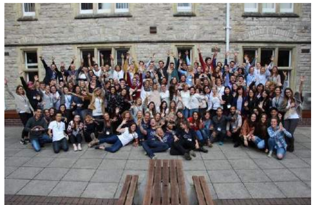
Below: Delegates of the European Region WCCS annual meeting.

With very positive feedback, it was clear that the event positively influenced the students present. WCCS thanks all who were involved, including speakers, sponsors and students, for contributing