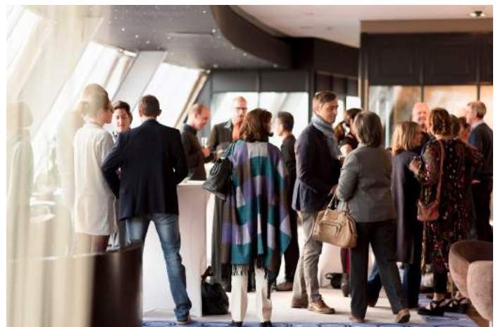
Chiropractors from across Europe help the Belgian Chiropractors' Union to celebrate its 70th anniversary.

It was a very proud moment for all of us when the BCU was presented with an award from the ECU for 70 years of outstanding service to the chiropractic profession, our promotion of the highest ethical standards and the standing of chiropractors as experts in spinal health within the healthcare system. BV