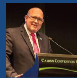
WFC in Australia for CAA Convention